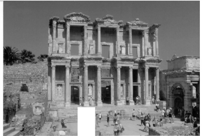
The Celsus Library at Ephesus

This was one of the biggest libraries during that time. It had several reading areas with many windows. This gave readers lots of light. Back then people wrote on and read from scrolls. There were almost 12,000 scrolls in this library. The tour guide said the double walls protected the scrolls from the high heat. I can't imagine working in this old building. Where would I plug in my laptop?